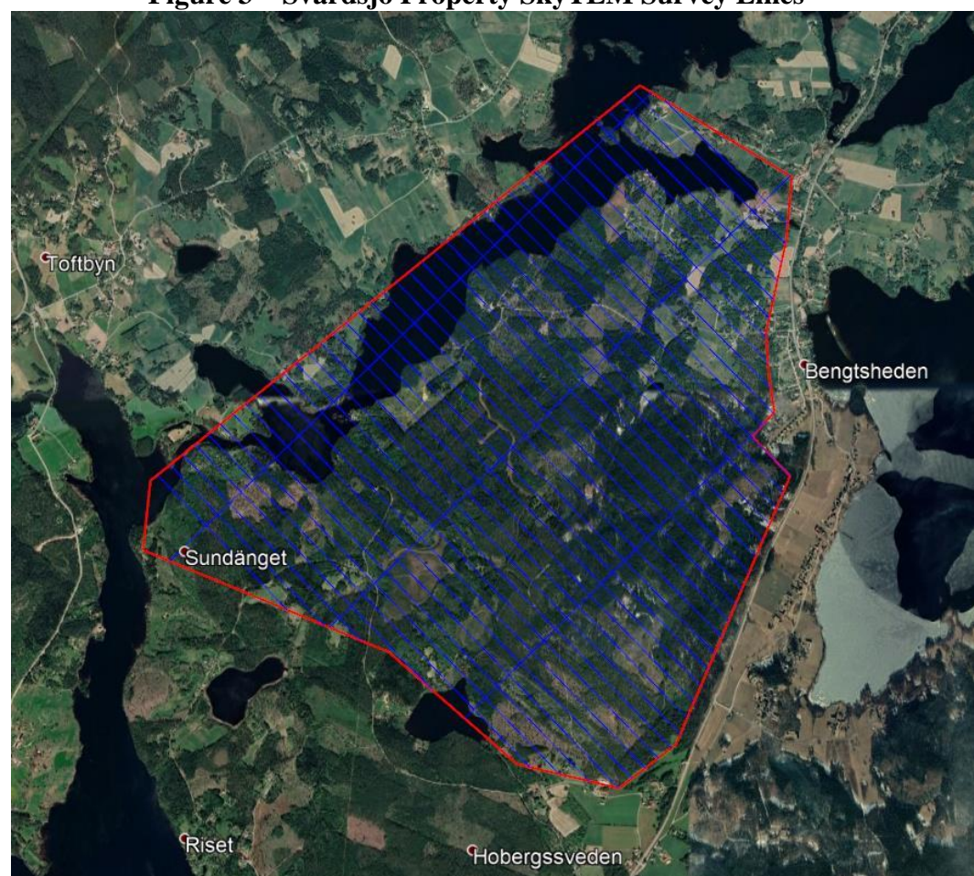
Figure 3 – Svärdsjö Property SkyTEM Survey Lines